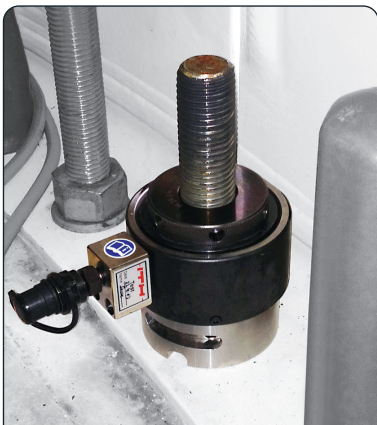
Bolt tensioning cylinders