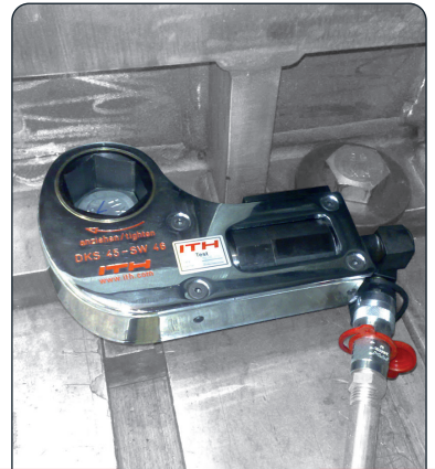
Hydraulic cassette wrench