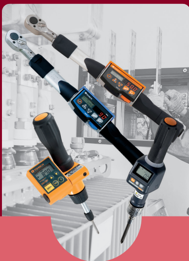
Digital torque tools