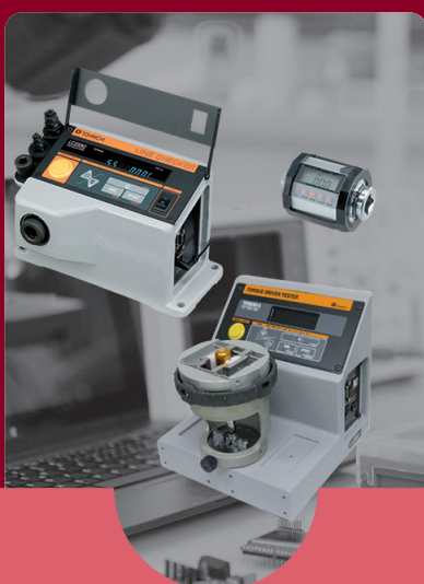
Rail disc saw