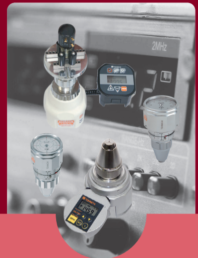
IBAV extraction device