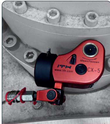
Hydraulic torque wrench